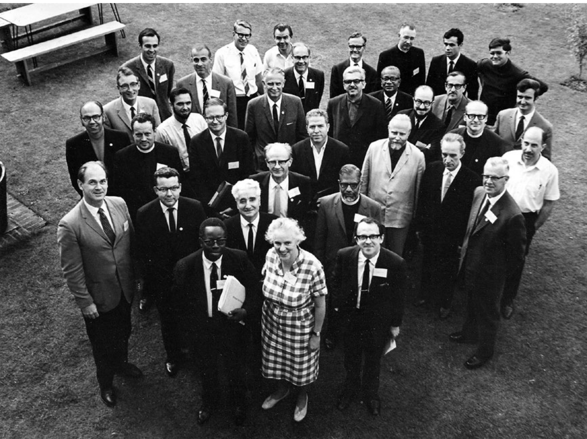
Working Committee of the Faith and Order Commission (WCC), Eliot College, Canterbury, August 4–8, 1969.